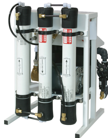
Titan 1000 200030 Pictured with Optional Flow Meters