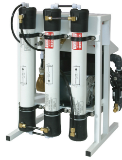
Titan 1000 200030 Pictured with Optional Flow Meters